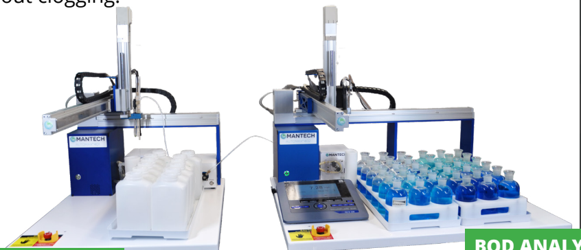
SAMPLE TRANSFER & pH Adjustment